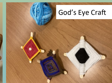
God's Eye Craft